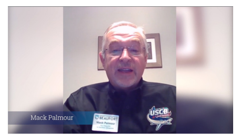
International Food Truck Day with Mack

All About That Bean (with their boba tea) Golden Sun Filipino Cuisine (with their lumpia) Thai Truck (with their red curry dishes) Murican Border (with their Korean tacos) Jahmerican Jerk (with their jerk chicken)